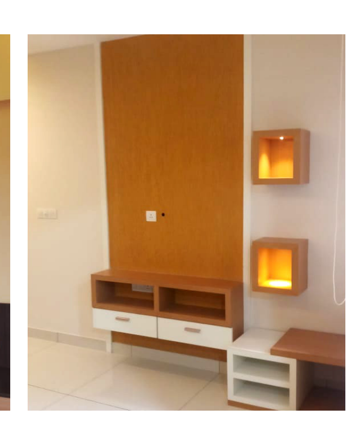
also served as an accent feature. Again spotlights are strategically placed to give the home a Zen Vibe.

The TV unit and the bedroom fixtures have warm colours. Niche and the false ceiling apart from its utility has