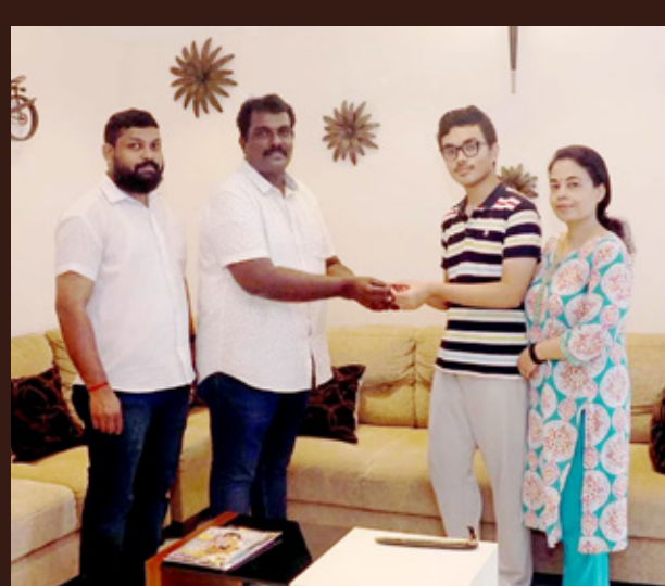
Our Team with the customers

When we came close to the completion of our new apartment, we remember the thoughts of sourcing an interior designer, which was daunting for us as we were looking for a one-stop solution for all our interior design needs.